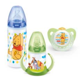
Winnie the Pooh