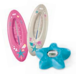
Bath Thermometer & Digital Bath Thermometer