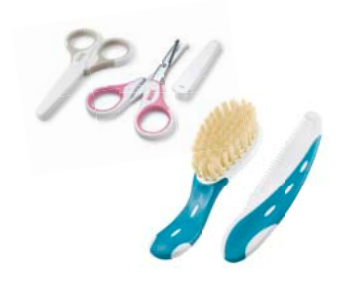
Baby Nail Scissors & Baby Brush with Comb