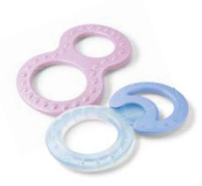
Teething Ring & Cool Teething Ring Set