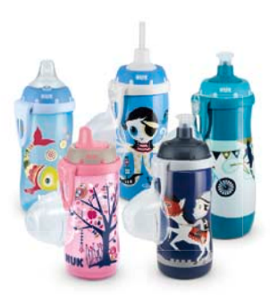
Active, Kiddy, Flexi, Junior & Sports Cup