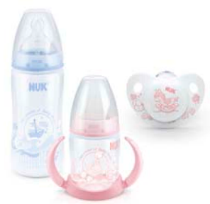
Rose & Blue