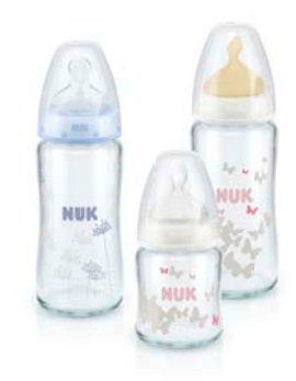
First Choice<sup>+</sup> Glass Bottles