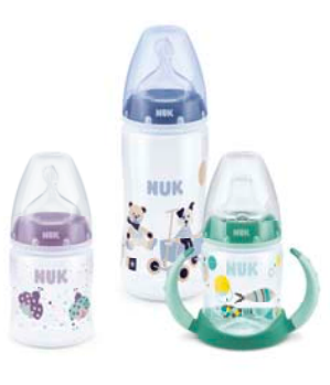
First Choice<sup>+</sup> PP Bottles & Learner Bottle