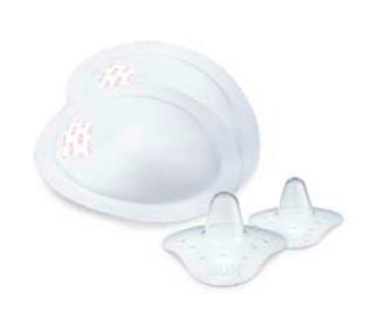
Classic Breast Pad & Nipple Shield