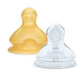
First Choice<sup>+</sup> Teats (Latex & Silicone)