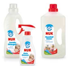
Laundry Detergent, Stain Remover & Household Cleaner