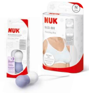
Pelvic Floor Trainer & Maternity Underwear