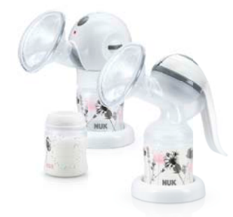
Breast Pumps & Breast Milk Container