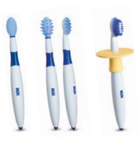
Cooling Stick, Training Toothbrush Set & Starter Toothbrush