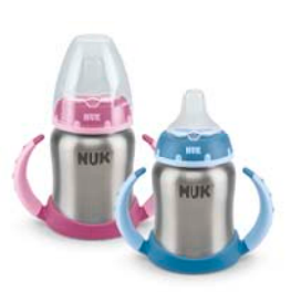
First Choice Stainless Steel Cup